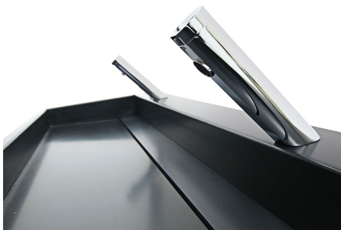
Black with optional sensor operated taps. Shown with gulley cover in place.