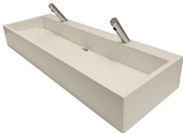
White with optional sensor operated taps. Shown with gulley cover removed

Please refer to the Technical Specification Sheet